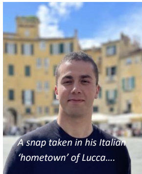
A snap taken in his Italian 'hometown' of Lucca....